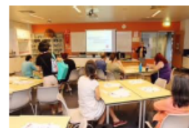
Teachers gathering at the PTANT Festival of Teaching