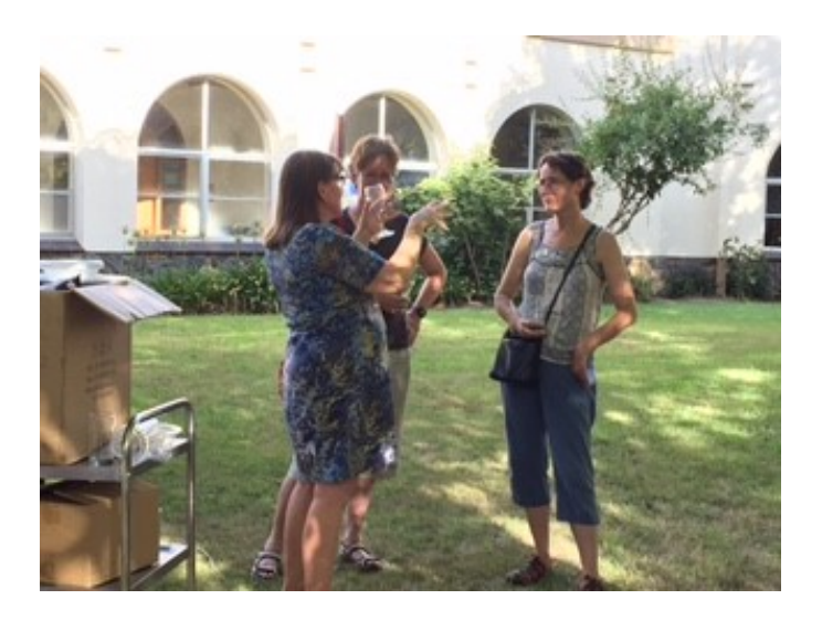
CMA Welcome event, 2017

CMA Conference, 19 August : ADFA. Details to be announced.